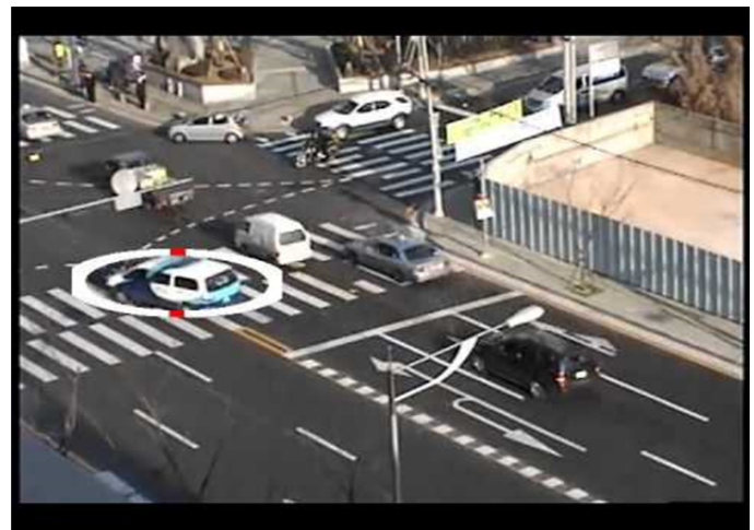
Fig. 1: Tracking a moving car

performed. Based on the changes to the properties of the object being tracked, object-tracking is a type of technique to track an object and to perform an immediate action on some other object which has no relation to the tracked object.